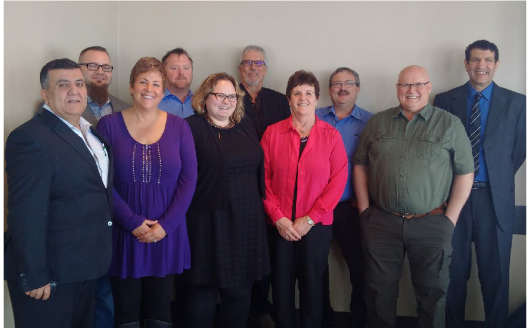
The Deputy Premier and Minister of Health, Sarah Hoffman, visited Lac La Biche County on March 30, 2016 to announce that a new, permanent dialysis unit will be constructed in the William J. Cadzow Health Centre. Design for the unit will start this spring. Here, Minister Hoffman and County Council pose for a photo after a meeting where they discussed health services in the County.