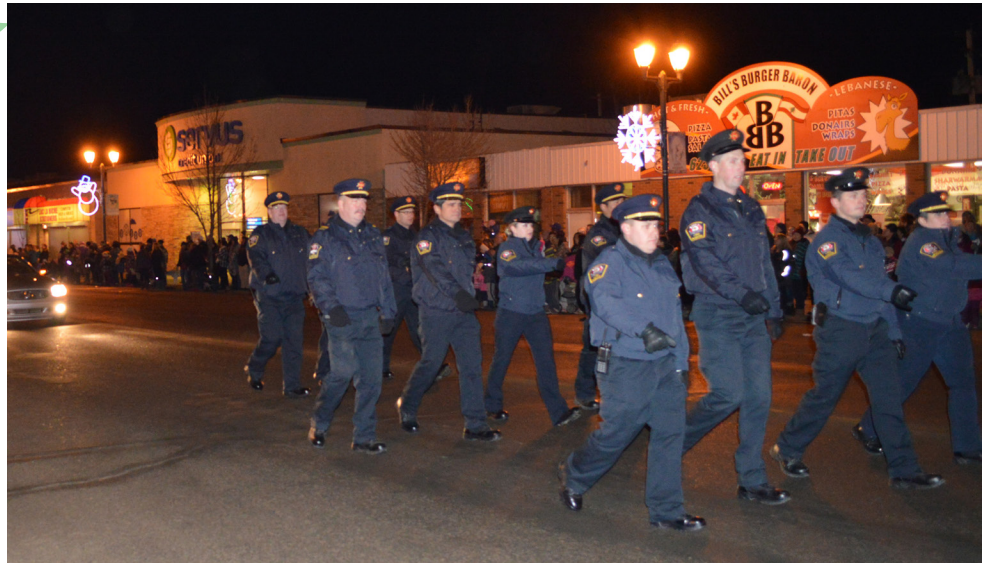
Lac La Biche County took part in the first annual Santa's Helpers Santa Claus parade on December 4. County fire fighters and the Lac La Biche Fire Fighters' Society worked to raise funds for local families in need during the holiday season. Their goal was to raise $25,000 during a three-day blitz of events that included an open house at the Lac La Biche fire hall on Saturday. They ended up raising $41,000. Great work Santa's Helpers!