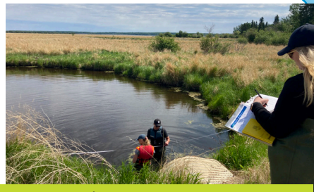
Among other programs, Lac La Biche County tests water quality at lake entry points, preserves and restores wetlands and shorelines, and encourages environmental awareness in the community.

We hear people when they say "fix the lake," and we wish it was that simple. It's a complex process, but we're committed to doing what we can to keep the lake healthy and sustainable for future generations.