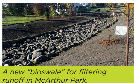
A new "bioswale" for filtering runoff in McArthur Park.