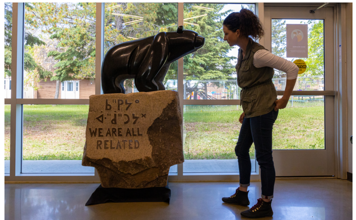
Learning about Treaties and Indigenous worldviews at Portage College Museum of Aboriginal Peoples' Art & Artifacts.