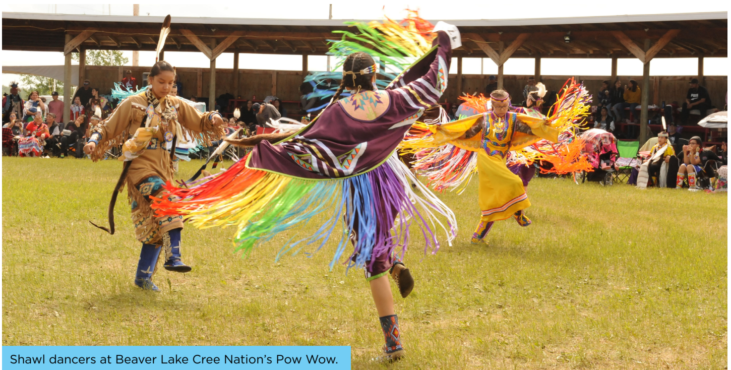
Shawl dancers at Beaver Lake Cree Nation's Pow Wow.