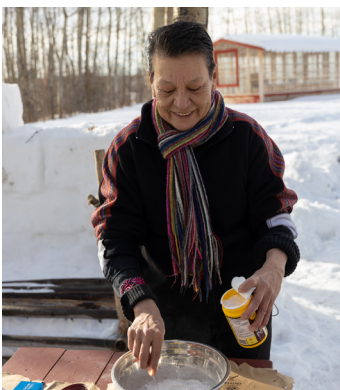
(Left) Making bannock at Hideaway Adventure Grounds in Kikino Métis Settlement.

You don't need to get fancy with it. Simply including a Land Acknowledgement is an act of reconciliation and a gesture of respect.