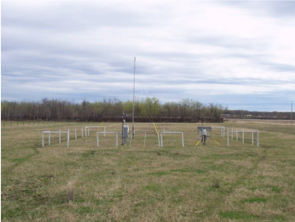
Rich Lake Weather Station