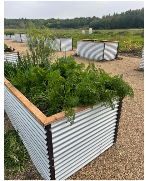
New raised-bed plots in the Community Garden.

To apply for a plot, fill out the form on our website. Applications are accepted until June 1. If you need any assistance, call 780-623-6739.