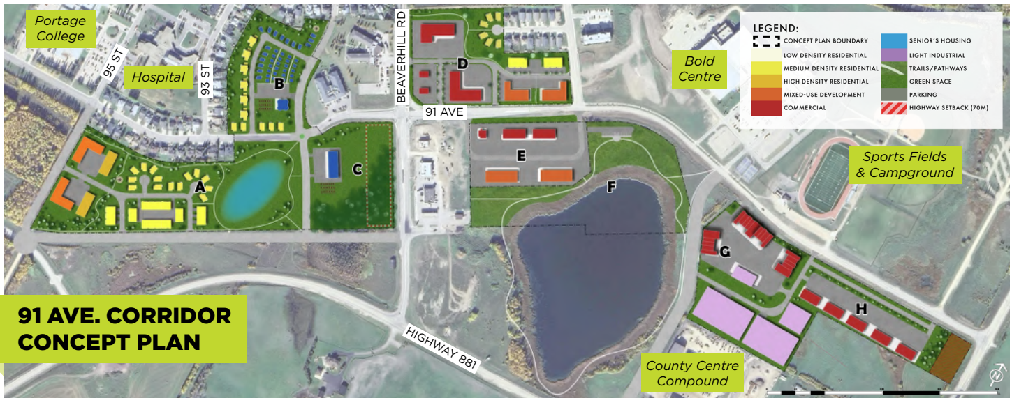
91 AVE. CORRIDOR CONCEPT PLAN

What happens now? A concept plan is a set of high-level guidelines, not specific marching orders. Council has essentially said “Yes, we like this vision,” so now the work of prepping the lands for development and pitching to potential investors can begin.