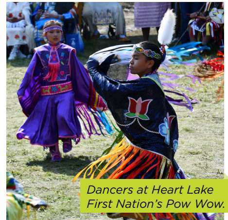
Dancers at Heart Lake First Nation's Pow Wow.

June is National Indigenous History Month, and June 21 is National Indigenous Peoples Day. In the spirit of reconciliation, we encourage all of our residents to learn about the Indigenous peoples of Canada and our region.