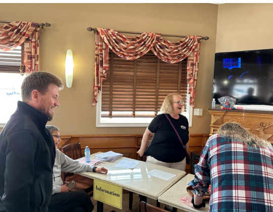
Mayor Paul Reutov (left) visiting the reception centre at Parkland II Motel.